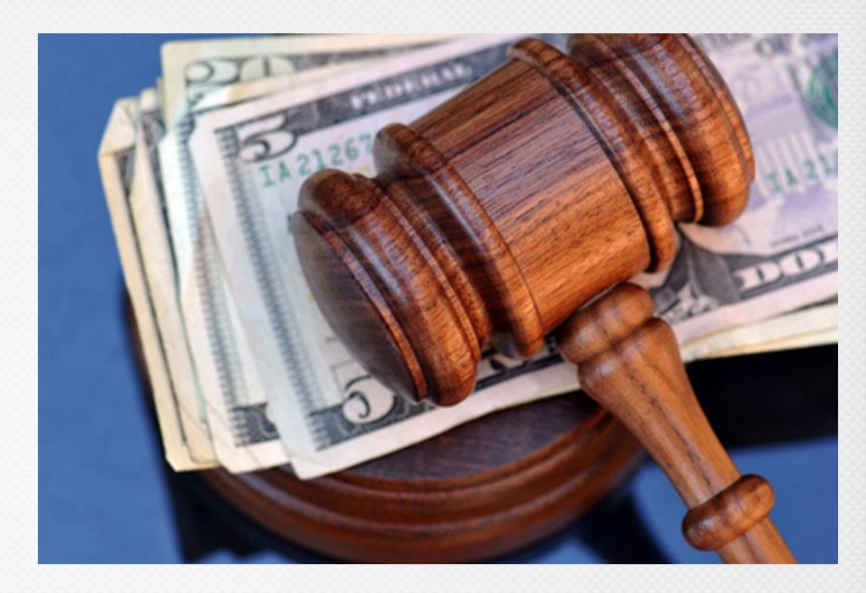
Sponsor: Sen. Steve Stadelman

requires law enforcement officials to accept cash to post bail. Due to a credit card machine malfunction, a county kept a man over a weekend for a minor offense.