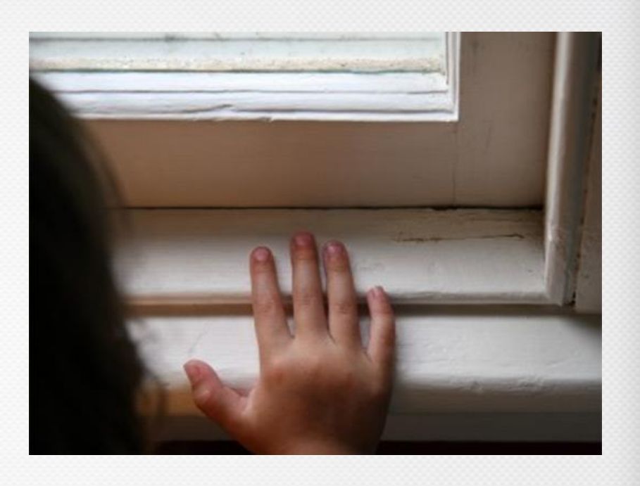
Sponsor: Sen. Donne Trotter

prohibits the sale or release of properties with high lead levels until the problem is mitigated and the property is considered safe. Older homes are more likely to contain lead and children are more susceptible to poisoning.